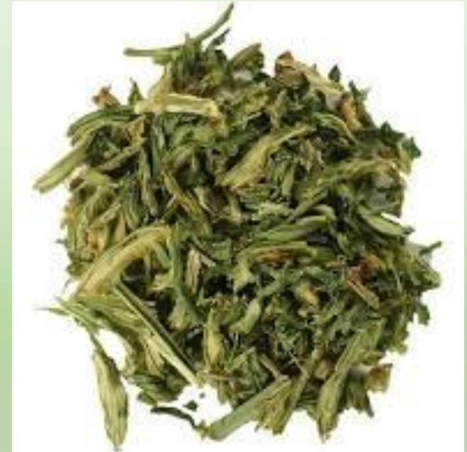
Celery leaf, dried ( Apium graveolens )