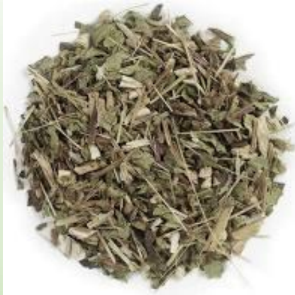
Echinacea Purpurea , dried